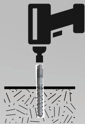
Quick Install & Remove